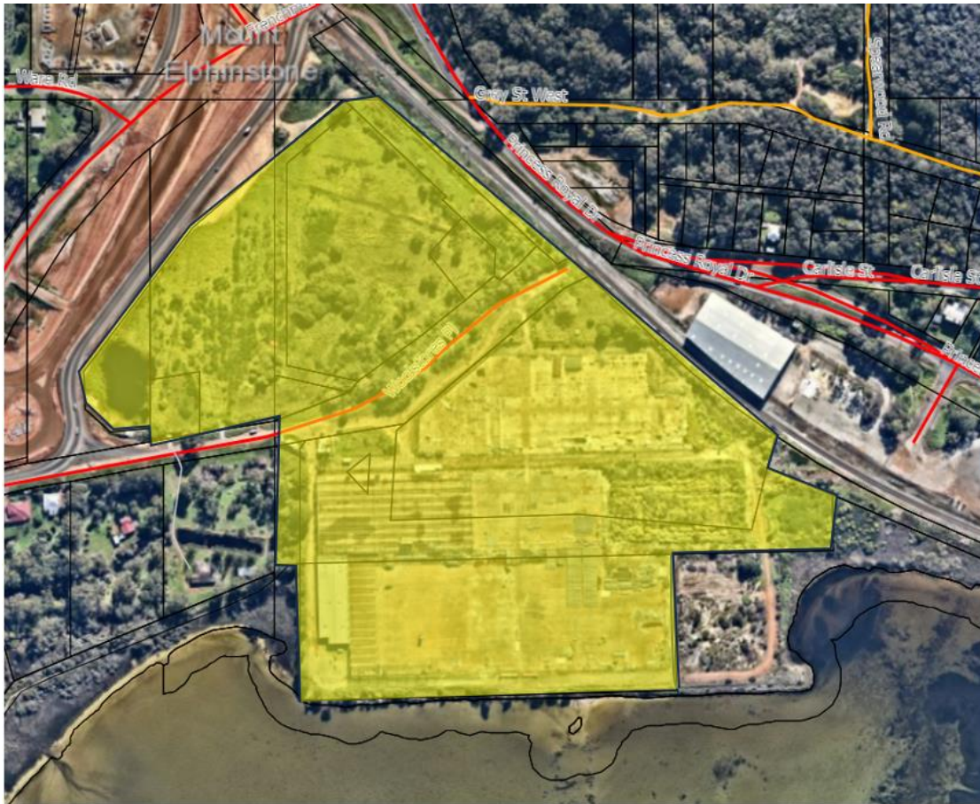
Figure 2: Subject site