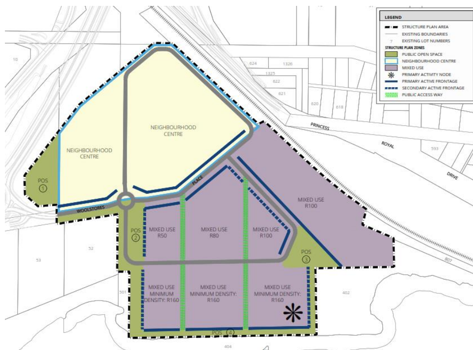
Figure 3: Structure Plan Map