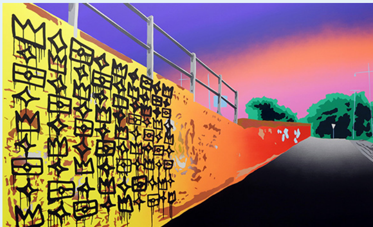
2013 Winner Overall Acquisitive Award: Reko Rennie. Bunbury Street (2013) acrylic and ink on linen

The coveted City of Albany Art Prize is back for 2014, with artworks from across Australia to be exhibited in a national showcase of contemporary painting.