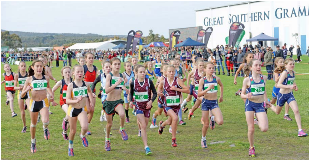
Competitors leaving the starting point at the National Cross Country Championships.