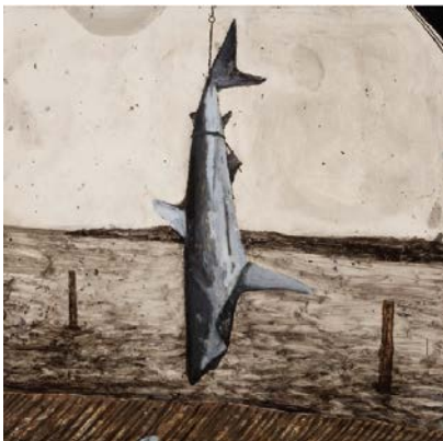
Richard Lewer (Victoria) "Untitled" 2014 Oil on epoxy coated steel. 100 x 100cm