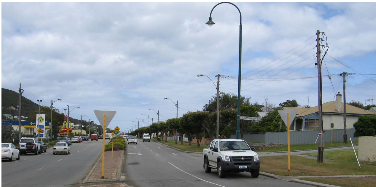
Current view of over overhead power lines, looking from Sandford Road towards York Street.