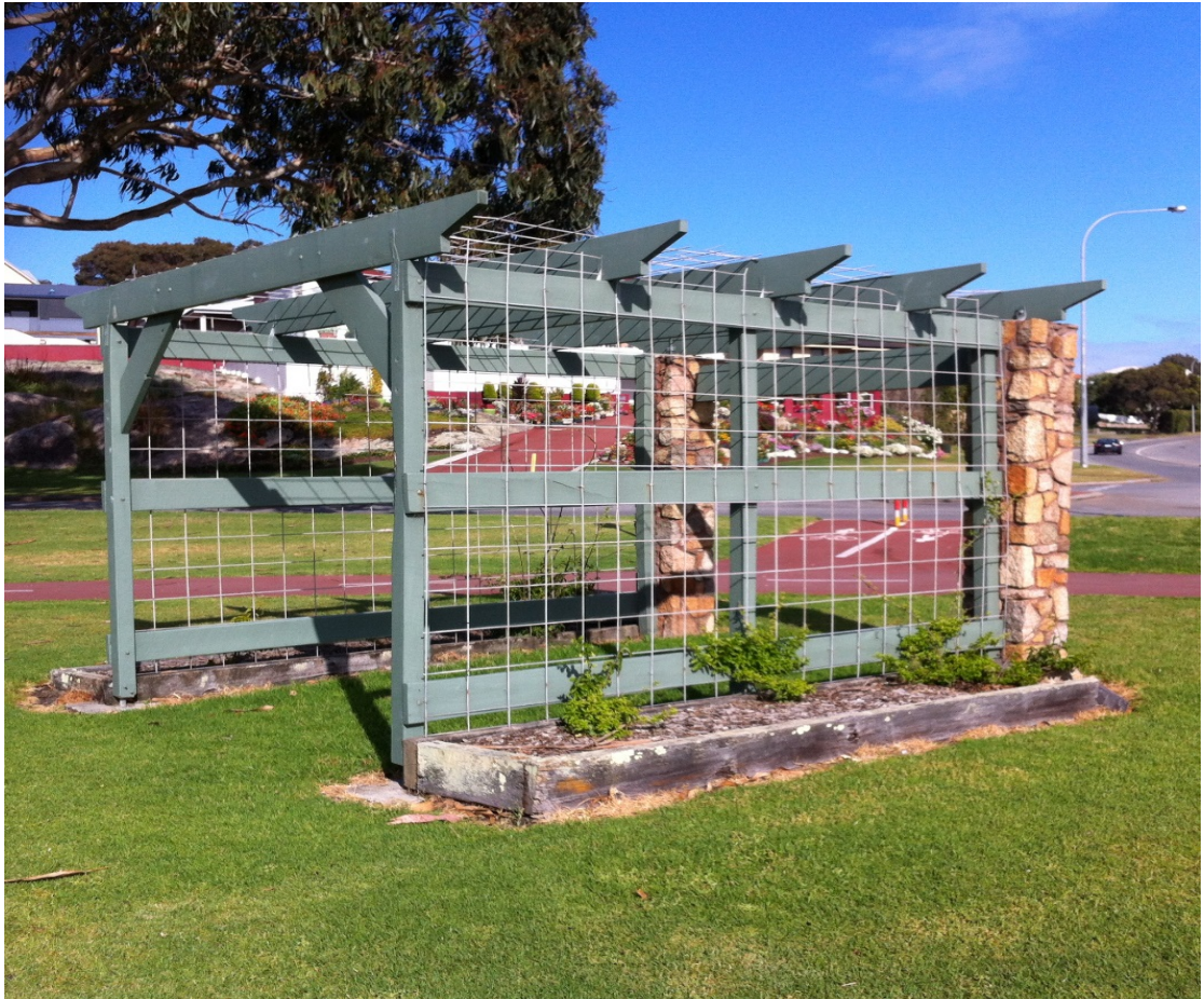
Existing structure - stone pillars are to remain