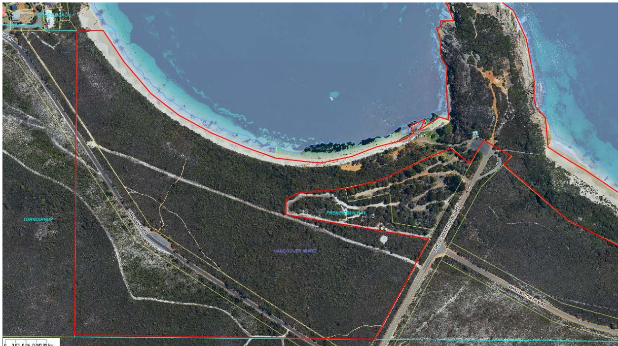
Reserve 21337 – off Vancouver Road, Goode Beach