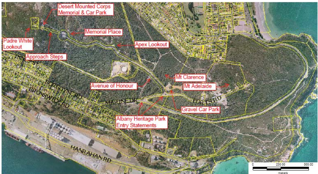
Diagram 2 - The planned locations of the infrastructure upgrades to Mt Clarence, and specifically the Avenue of Honour that affects the Albany Soapbox Club.