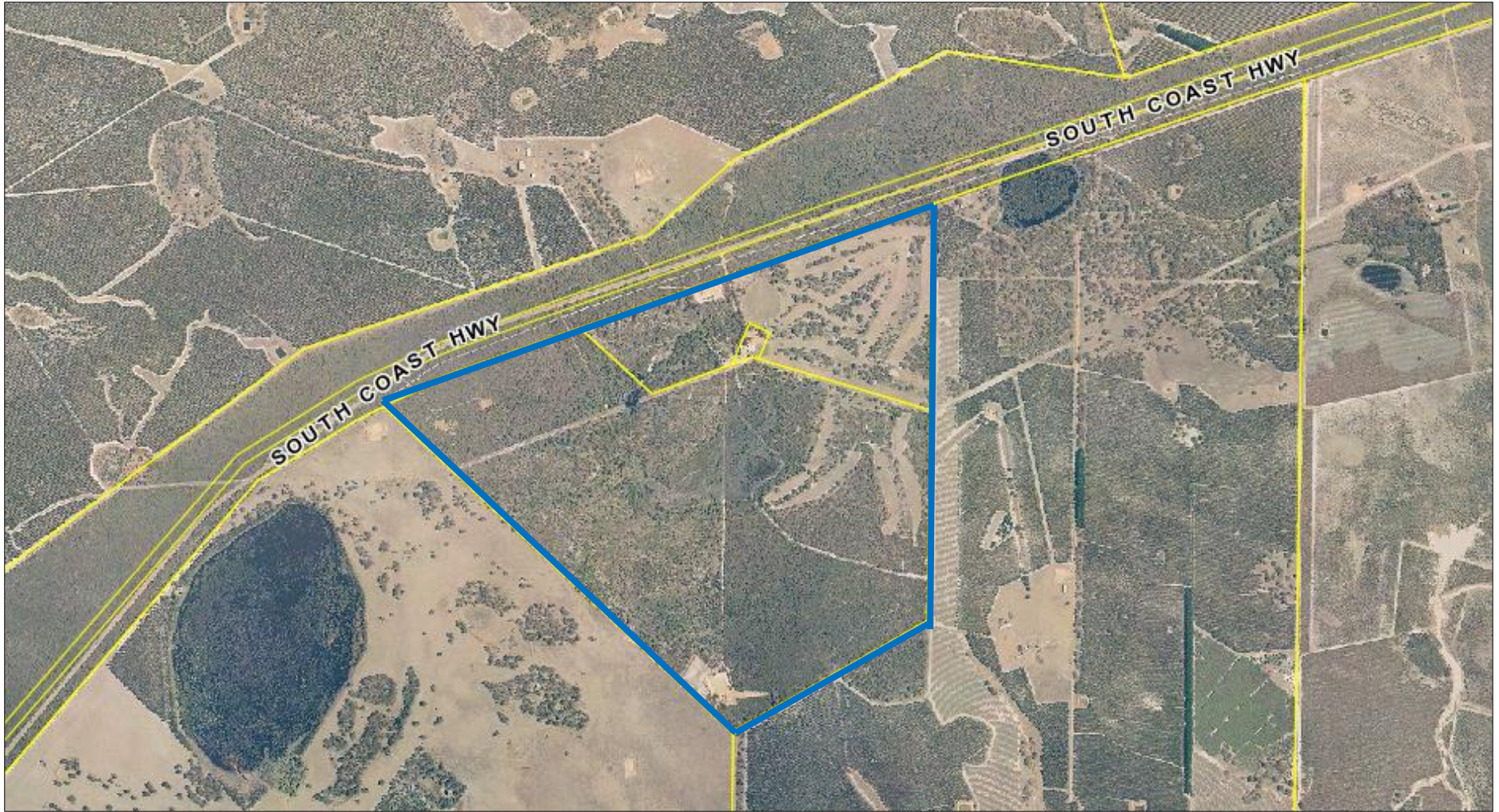
Green Range Country Club Lease area