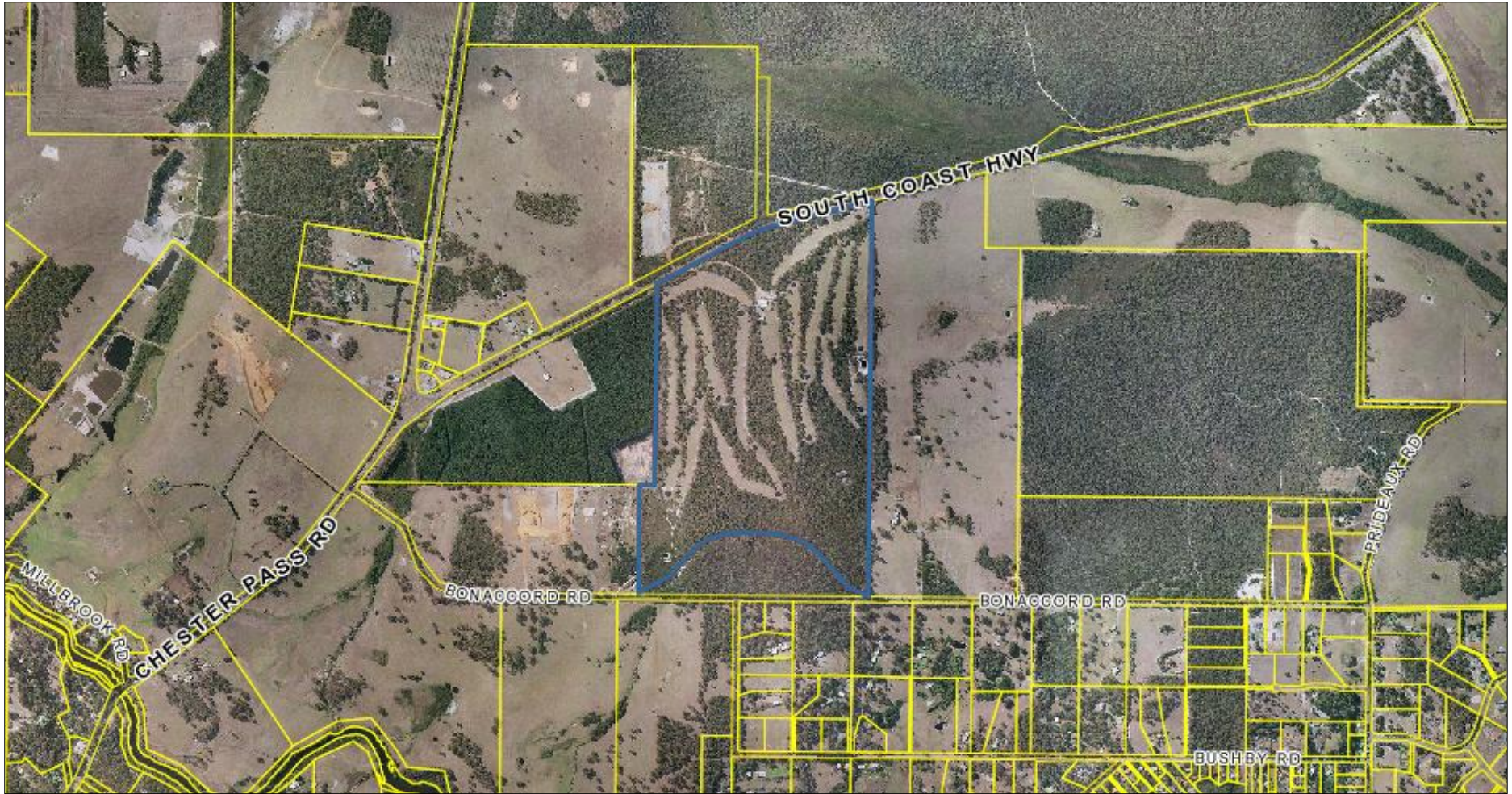
Riverview Country Club Lease area