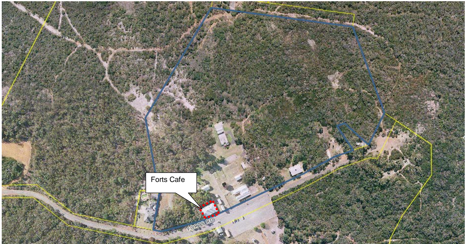
Forts Cafe – Lot 1347 on portion of Crown Reserve 38226, Mount Clarence