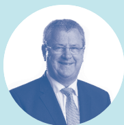
DENNIS WELLINGTON MAYOR

Together, we can build a future that we are proud to leave for future generations, one where every individual in Albany can prosper and thrive.