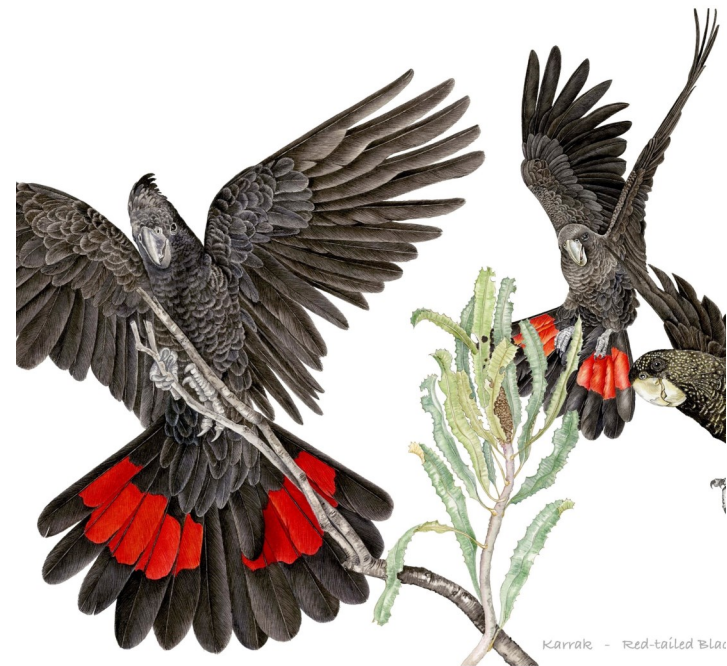
Karrak - Red-tailed Black