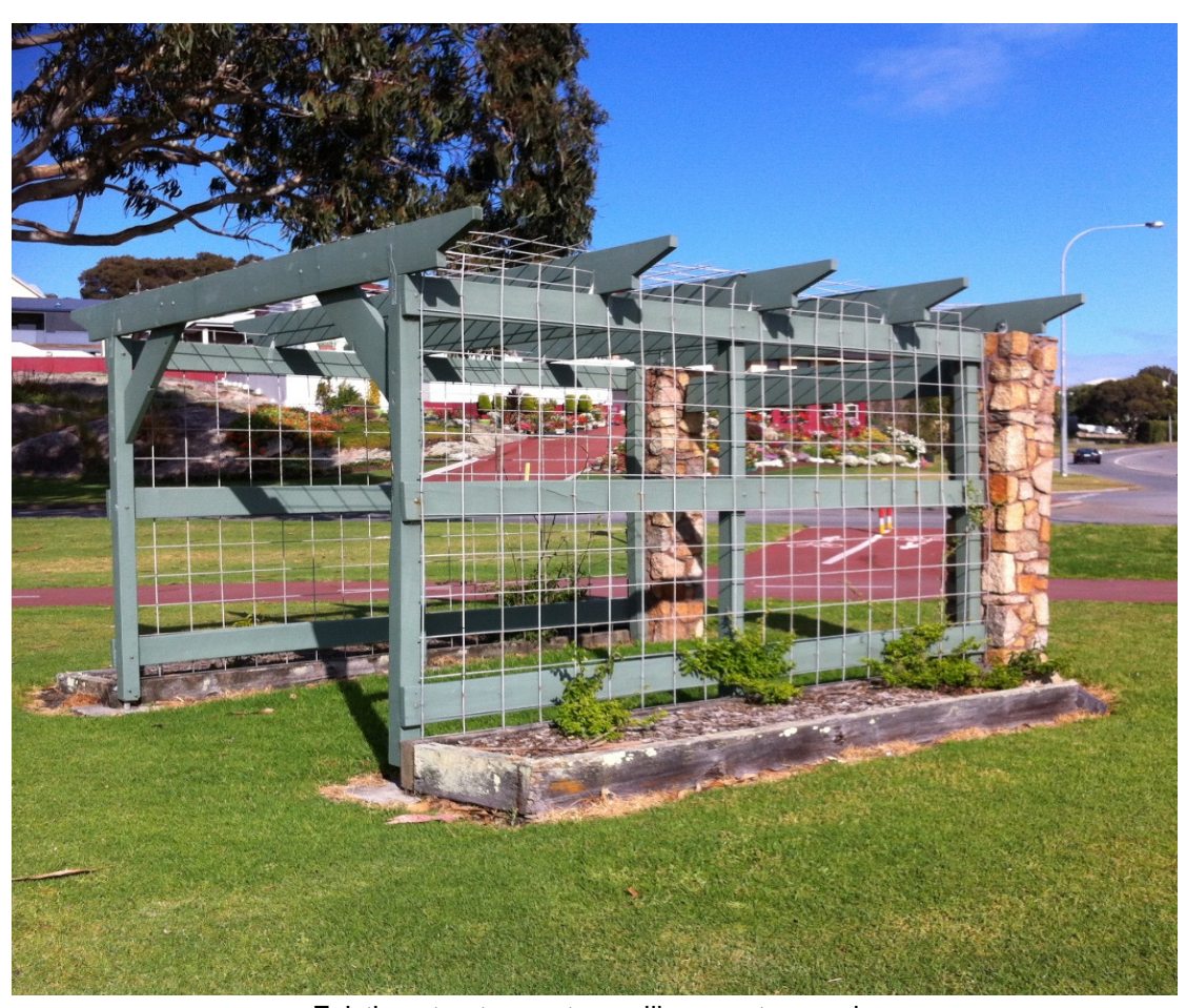
Existing structure - stone pillars are to remain