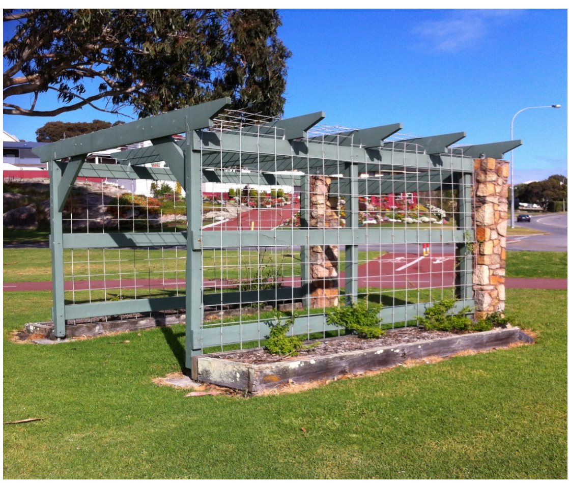
Existing structure - stone pillars are to remain