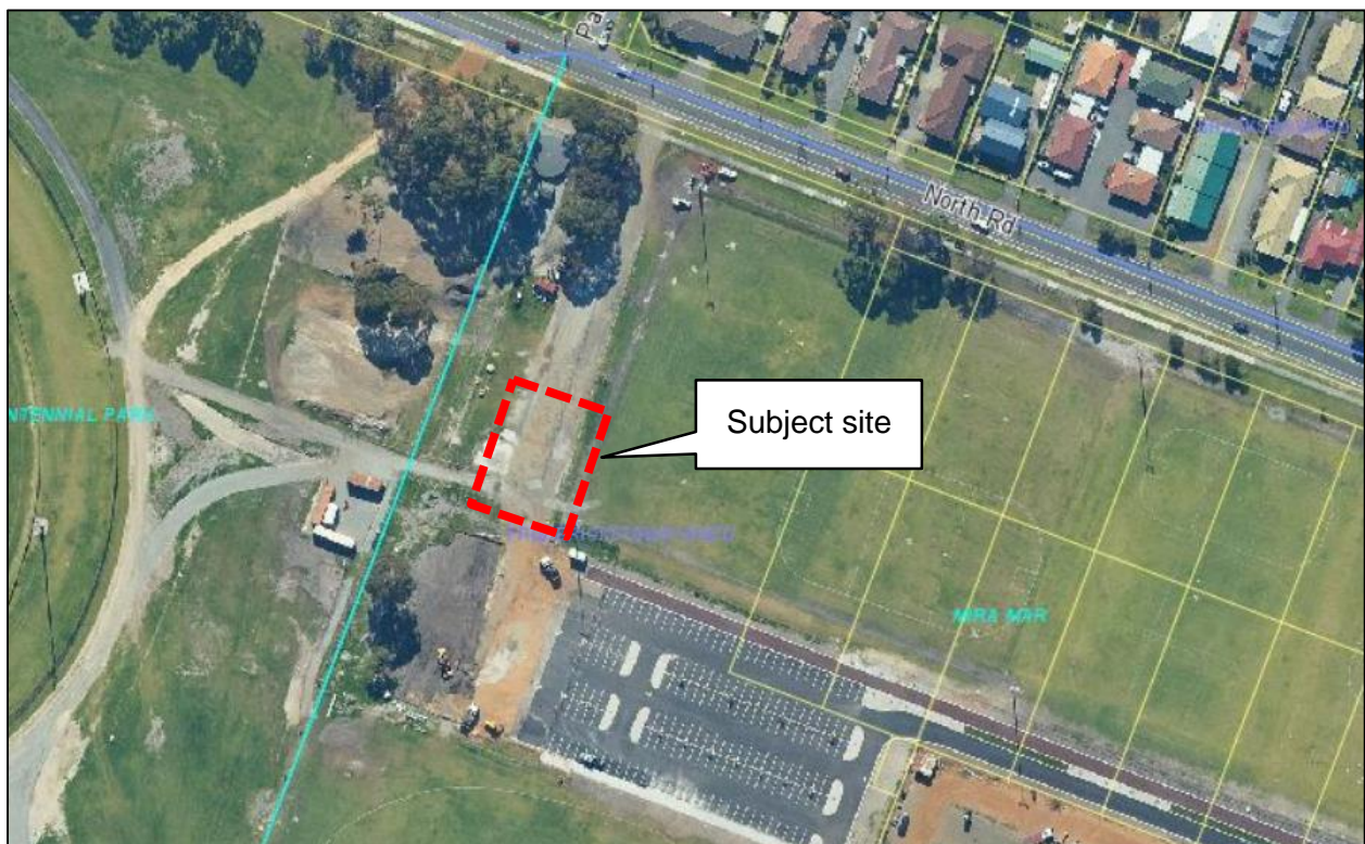
Aerial photograph – noting current imagery showing the completed Eastern Pavilion is not available