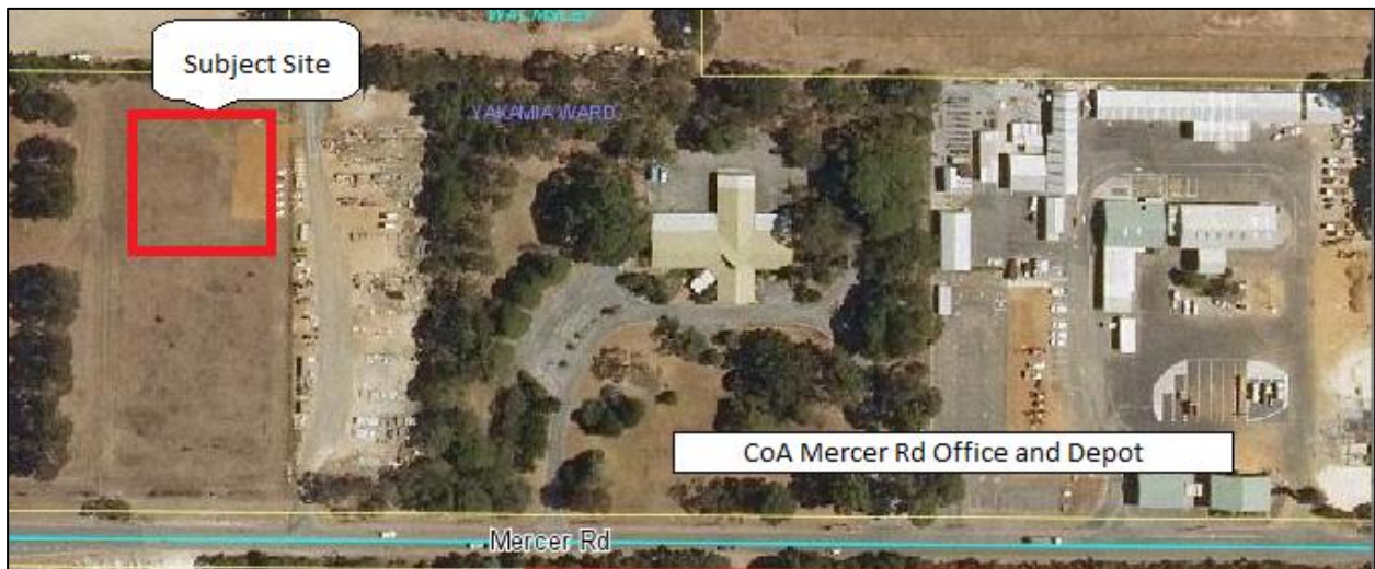
Aerial photograph of proposed new SES Facility Location