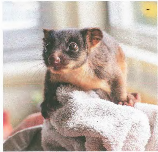
Baby Ring Tail rescued in David St 2020

From: Residents from around Kangas Reserve (four minute address)