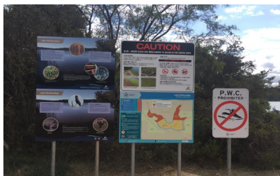
Signage installed at Lake Mullocullup