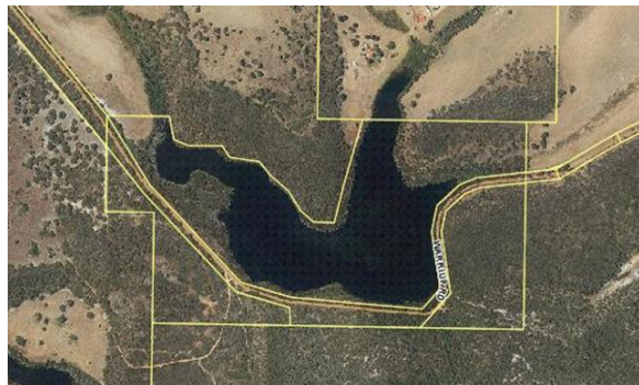
Lake Mullocullup – Warriup Road