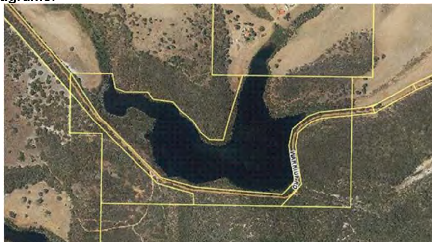
Lake Mullocullop – Warriup Road, Green Range