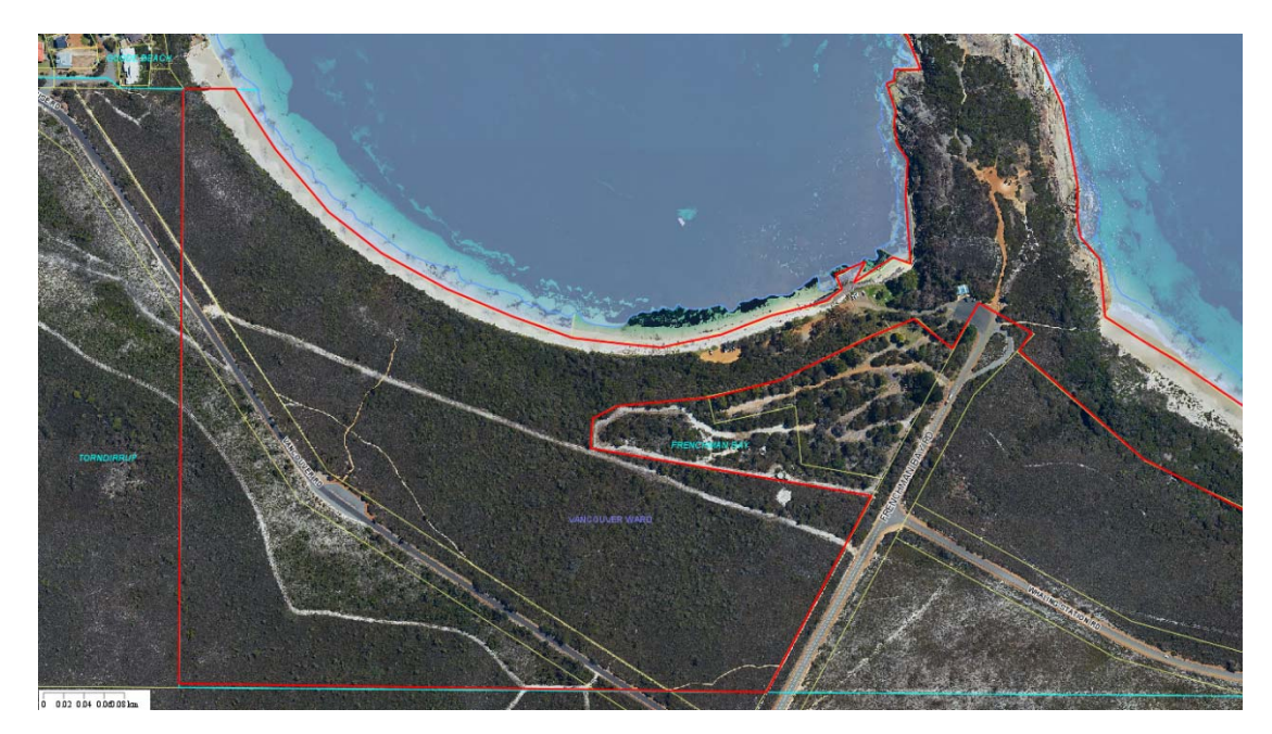
Reserve 21337 – off Vancouver Road, Goode Beach