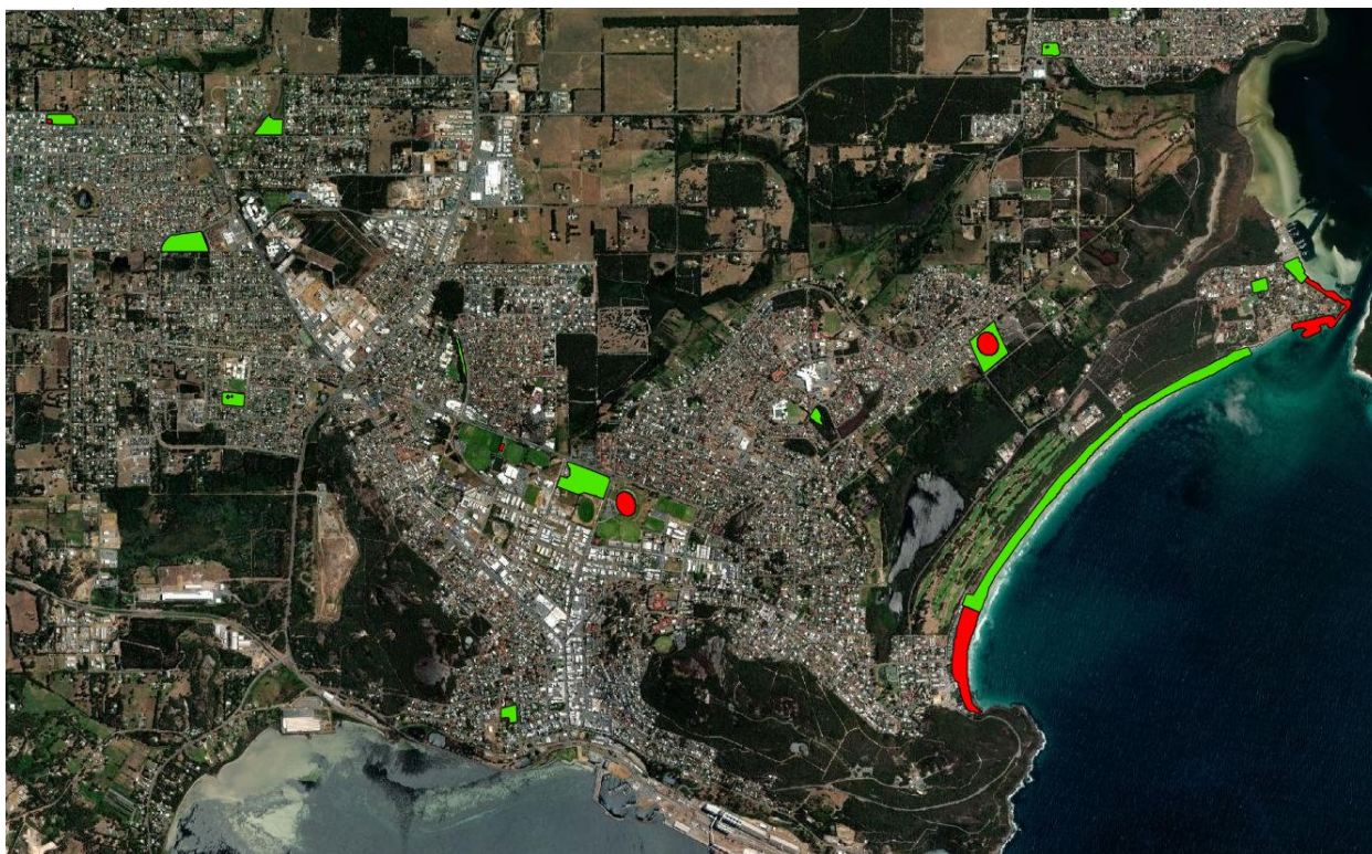
Figure 1: Current Off-lead Dog Exercise areas

Figure 2: Map showing recommended Location at Centennial Central Precinct