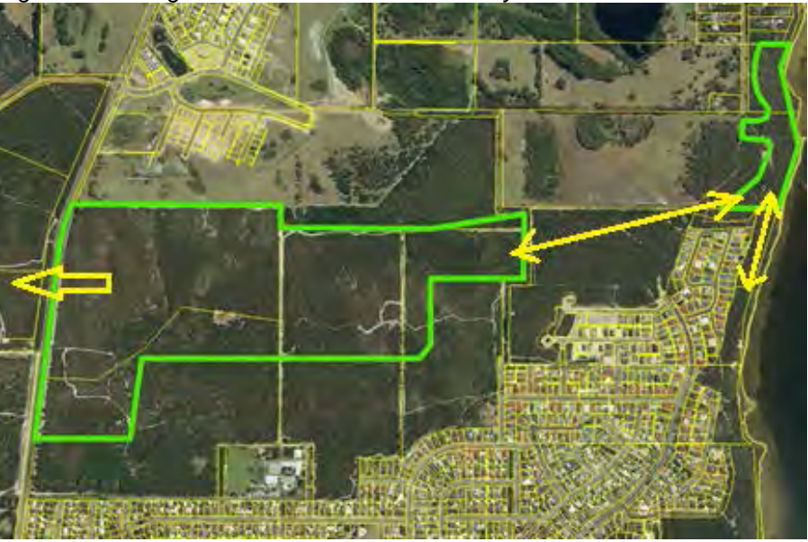
Figure illustrating conservation areas deemed by MS942.