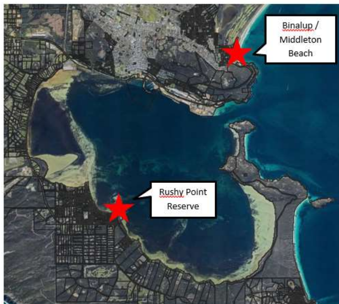
Figure 1 Location of subject sites at Rushy Point and Binalup / Middleton Beach.

Figure 6: Temporary Signs at Binalup / Middleton Beach install January 2022 to clarify rules.