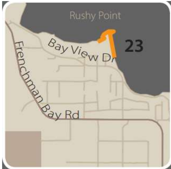
Figure 2 Existing Rural Leashing Area (orange area) at Rushy Point.