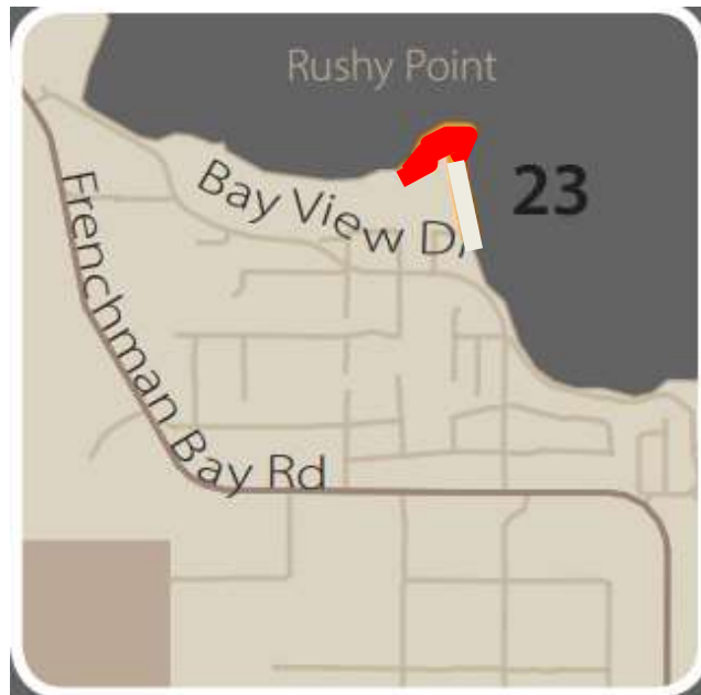
Figure 3 Proposed removal of Rural Leashing Area and proposed Dog Prohibited Area at Rushy Point