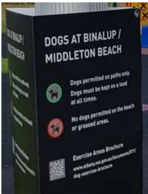
Figure 6: Temporary Signs at Binalup / Middleton Beach install January 2022 to clarify rules.