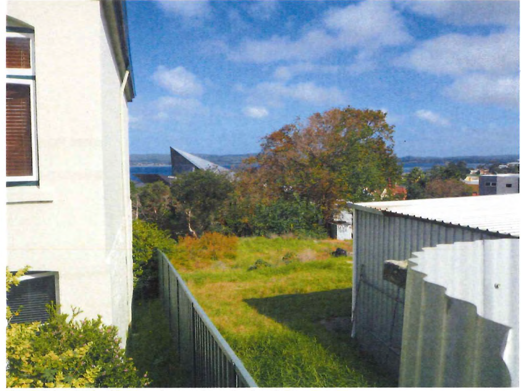
View of the site looking south west from Frederick Street.

View of the adjacent property to the east of Norman House showing the large hedge obscuring the view.