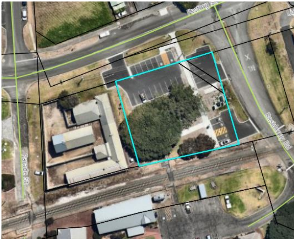
Aerial showing 2 x Fig Trees adjacent to the Old Gaol.