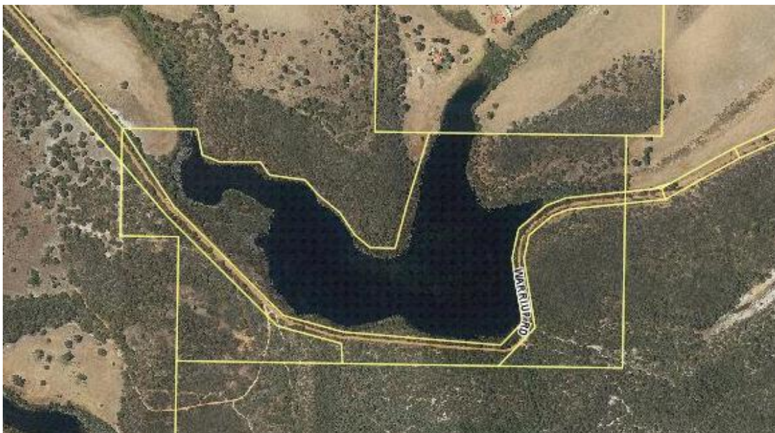
Lake Mullocullup – off Warriup Road, Green Range