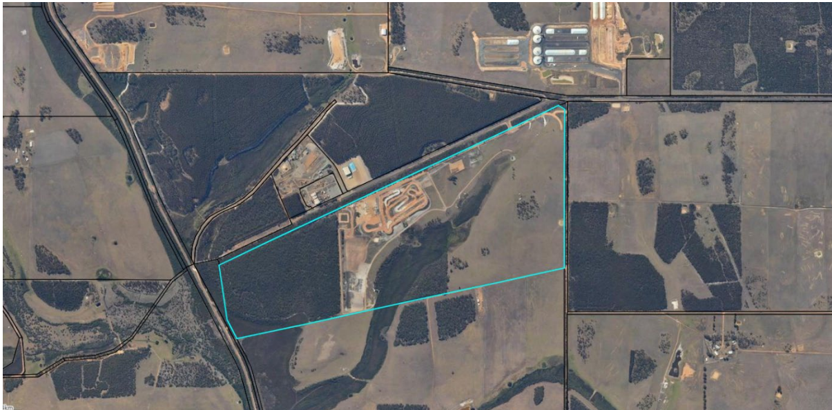
Aerial photograph of Albany Motorsport Park