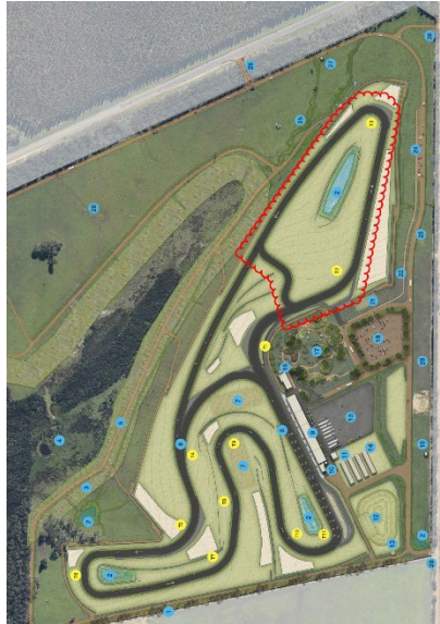
Northern Circuit Scope of Works (shown in red cloud)