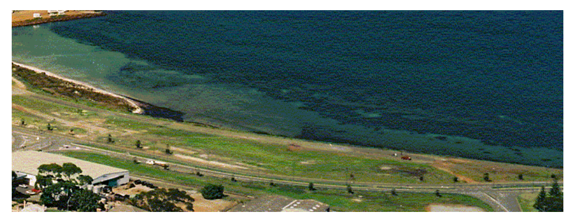
Current view of the site for the Albany Waterfront Peace Park