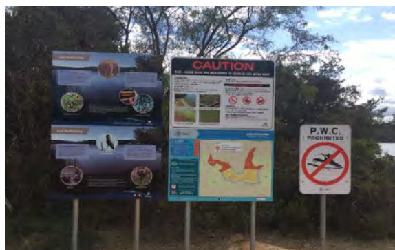
Signage installed at Lake Mullocullup