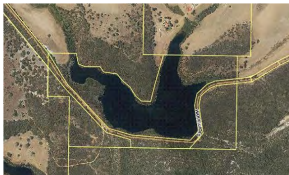
Lake Mullocullup – Warriup Road