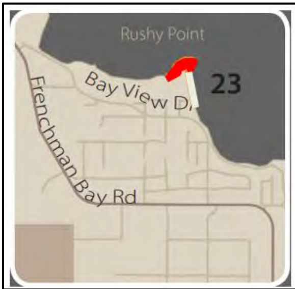
Figure 1 - New Dog Prohibited Area at Rushy Point and removal of Rural Leashing Area.