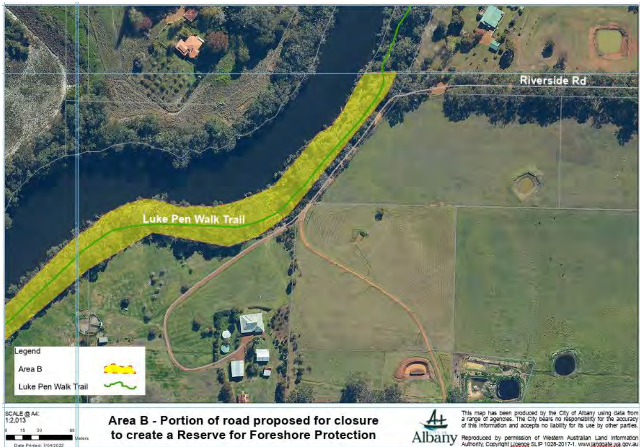
Figure 4: Area B – Proposed for Reserve for Foreshore Protection – close up of northern end