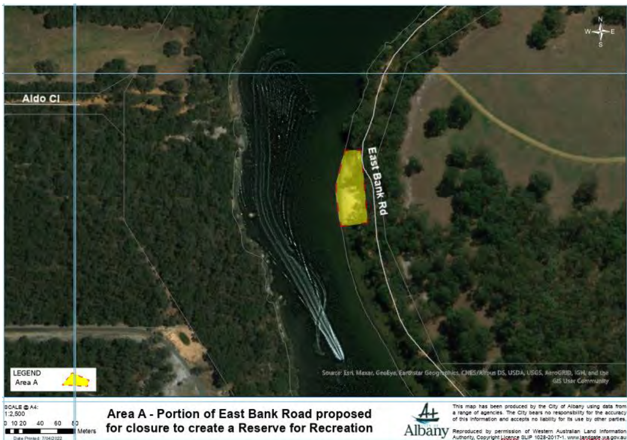
Figure 1: Area A – Proposed Reserve for Recreation.