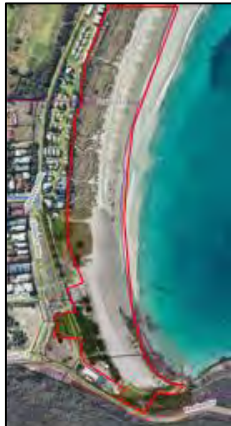
Figure 2 - Proposed amended boundary of the Dog Prohibited Area at Binalup / Middleton Beach.