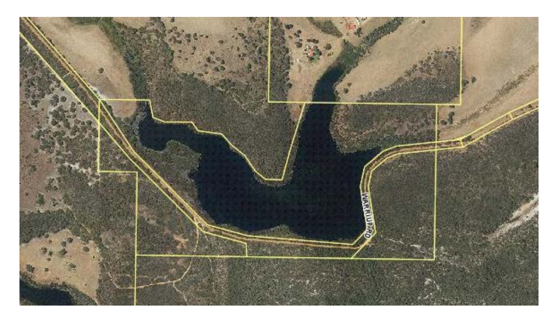
Lake Mullocullup - off Warriup Road, Green Range