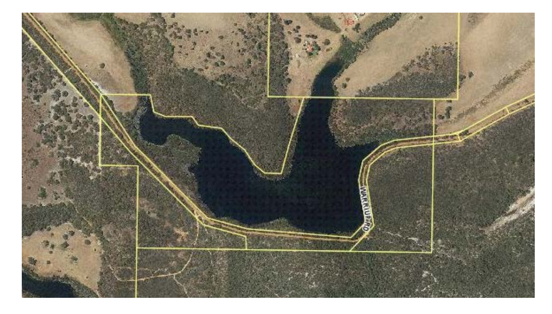
Lake Mullocullup – off Warriup Road, Green Range