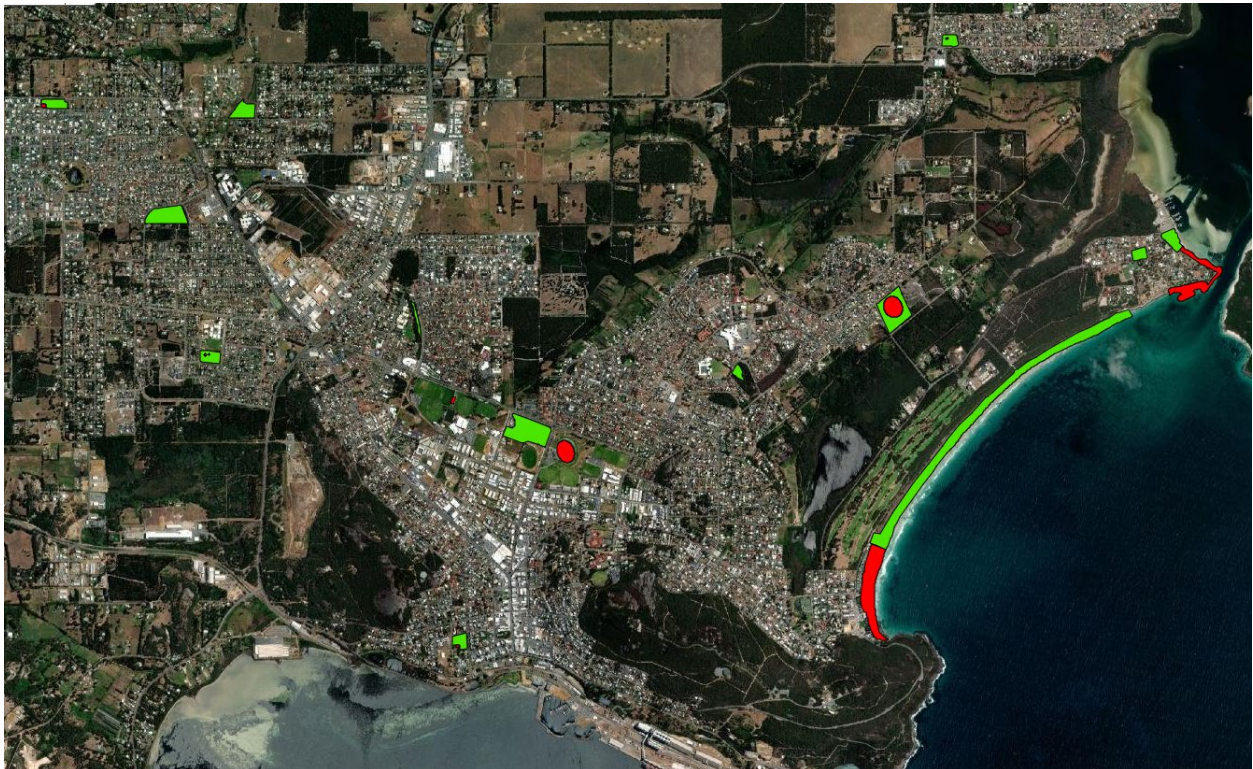
Figure 1: Current Off-lead Dog Exercise areas

Figure 2: Map showing recommended Location at Centennial Central Precinct