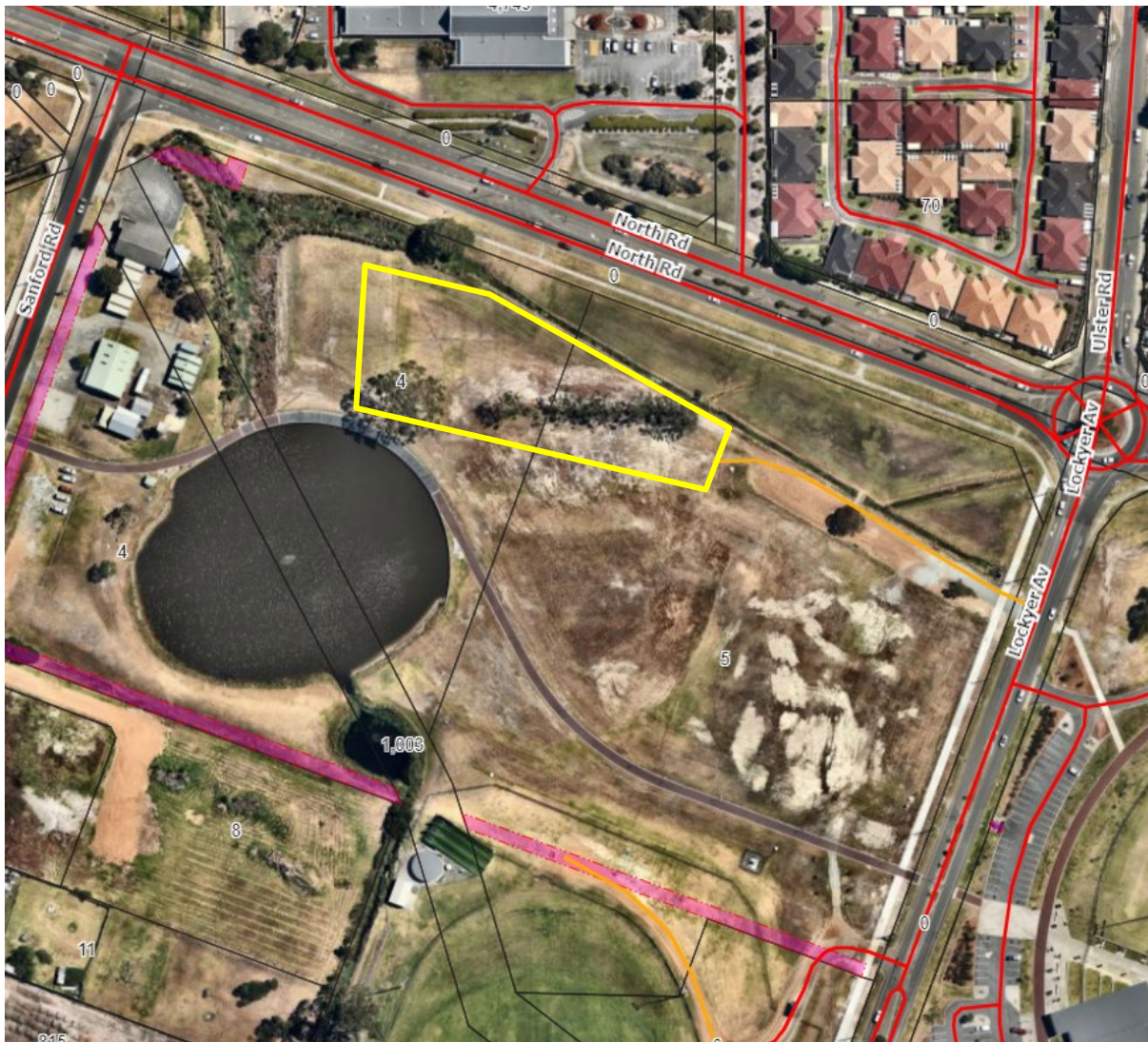
Figure 2: Centennial Central Precinct – Recommended Location