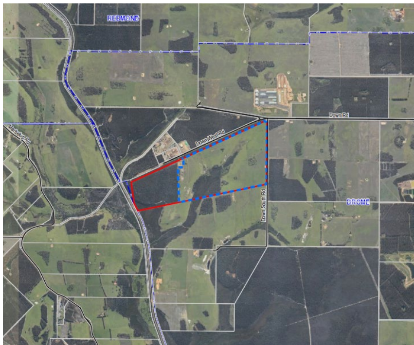
Aerial photograph of Albany Motorsport Park