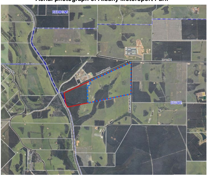
Aerial photograph of Albany Motorsport Park