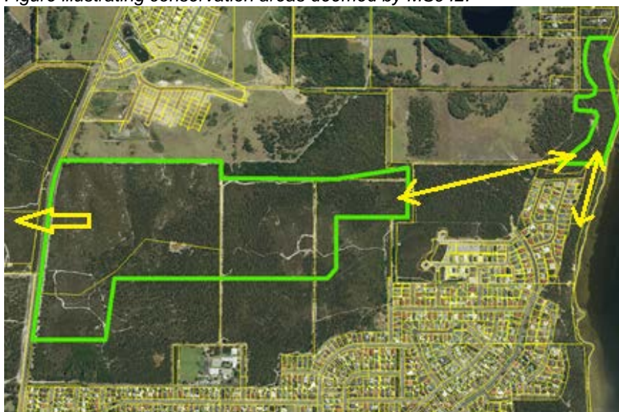
Figure illustrating conservation areas deemed by MS942.