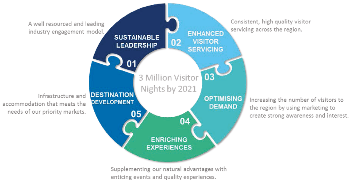
Figure 1 - TDS Key Focus Areas