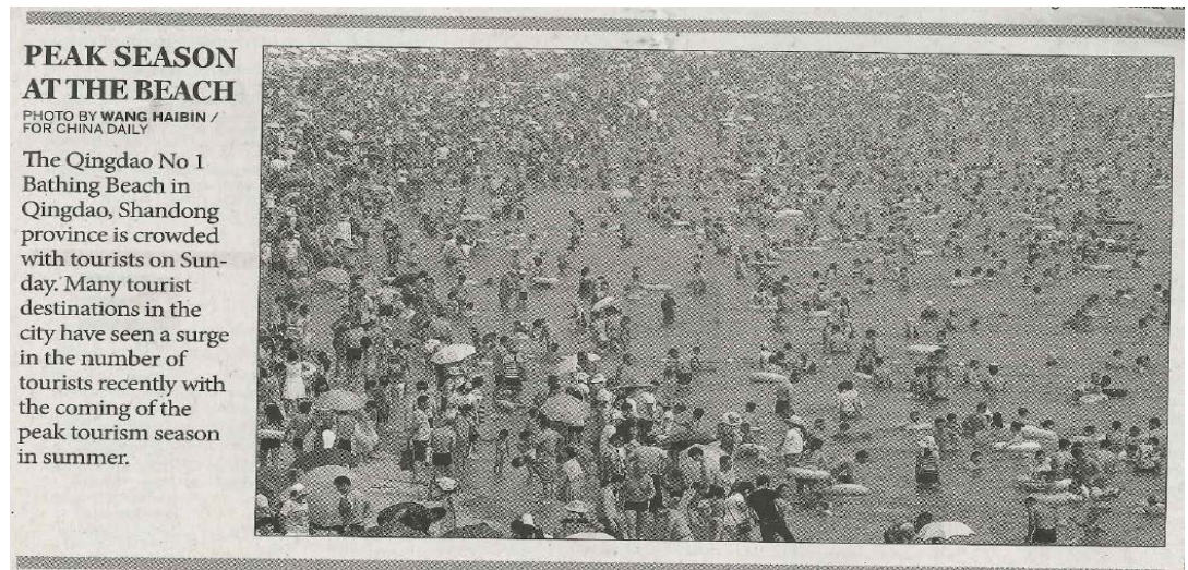
Figure 3 - newspaper article China Daily, 14 July 2014

ii. Albany's natural environment is also a major attraction with clean fresh air and sparsely populated beaches in direct contrast to what the Chinese visitor typically experiences. See image below taken from local newspaper during visit.