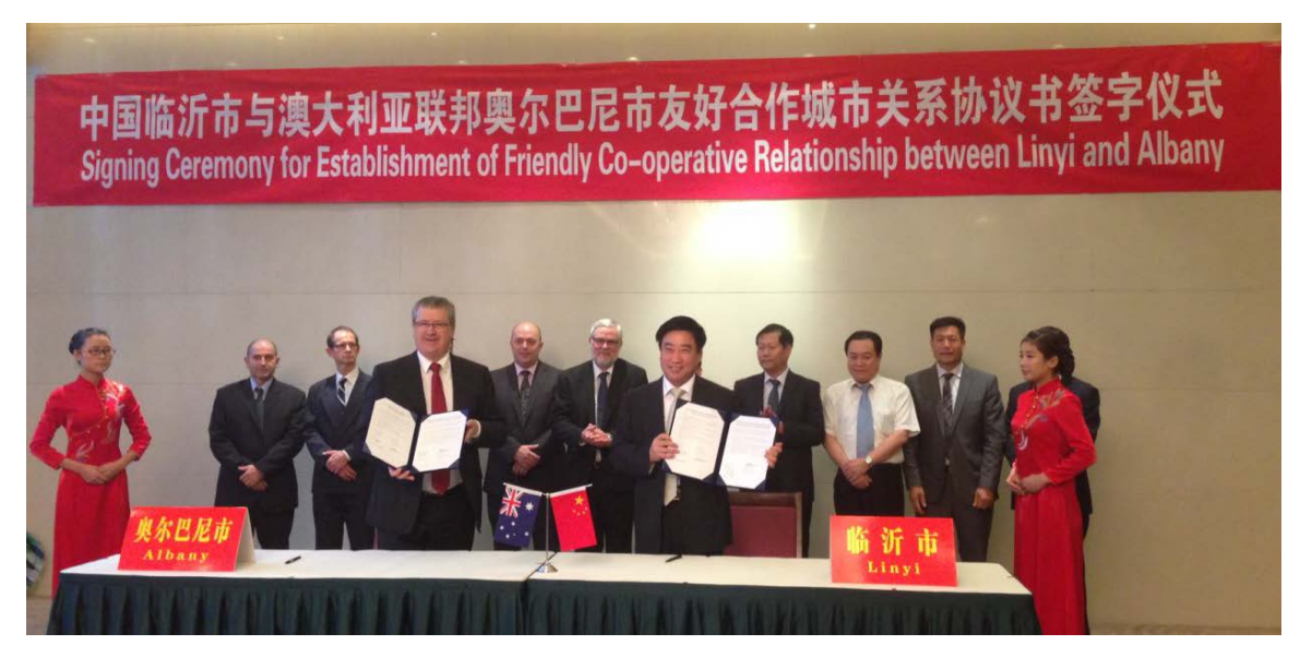
Figure 1 – signing ceremony Albany and Linyi