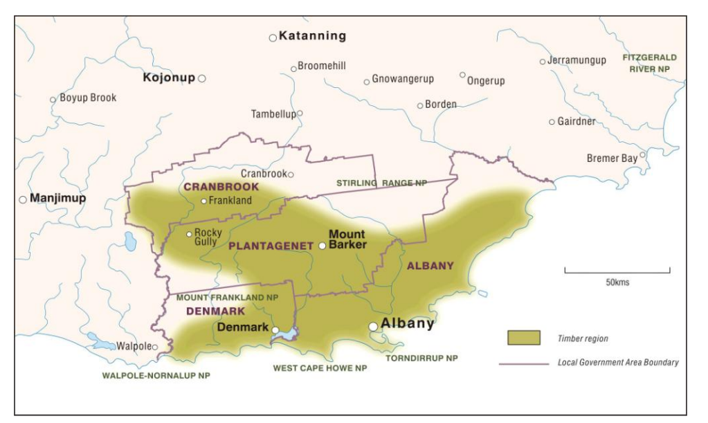
Figure 1: Great Southern TIRES region

The Great Southern TIRES region is defined as the plantation timber harvesting area within the four local government areas of Albany, Denmark, Plantagenet and Cranbrook, located at the southern part of the Great Southern Region (see Figure 1).