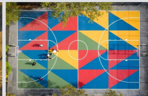
IMAGE: Harlem NY, artist Faith Ringgold, Project Blackboard