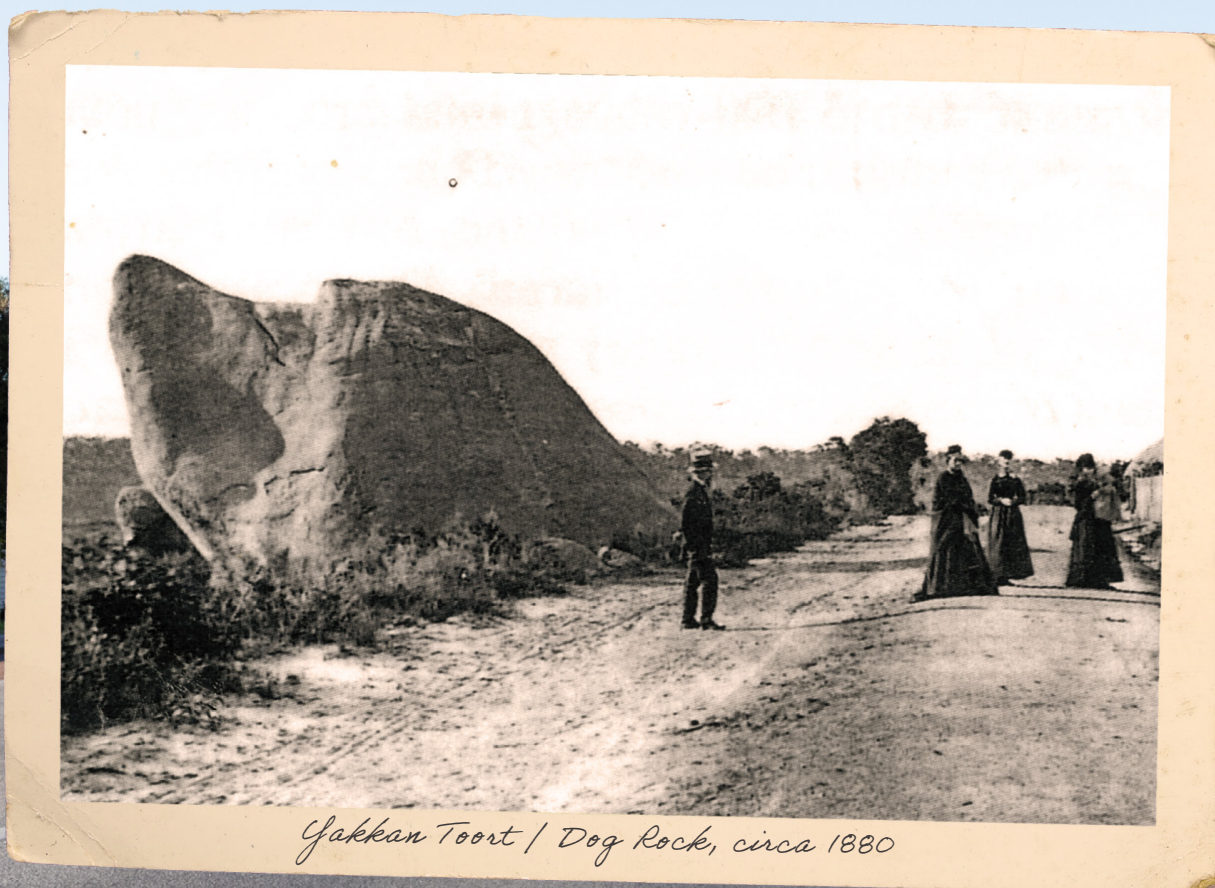
Yakkan Toort / Dog Rock, circa 1880

Albany's granite outcrop Yakkan Toort / Dog Rock – meaning 'wild dog tamed' in the Menang Noongar language – holds deep cultural significance for the Menang people and is a beloved local landmark. In the 1920s, the Albany Town Council proposed blasting part of the rock to widen the road, prompting a public outcry and a referendum that saved it. In the 1930s, the RAC recommended painting a white collar for visibility at night. Despite later calls to relocate it, Yakkan Toort / Dog Rock was classified by the National Trust in 1973 and remains an enduring Albany landmark.