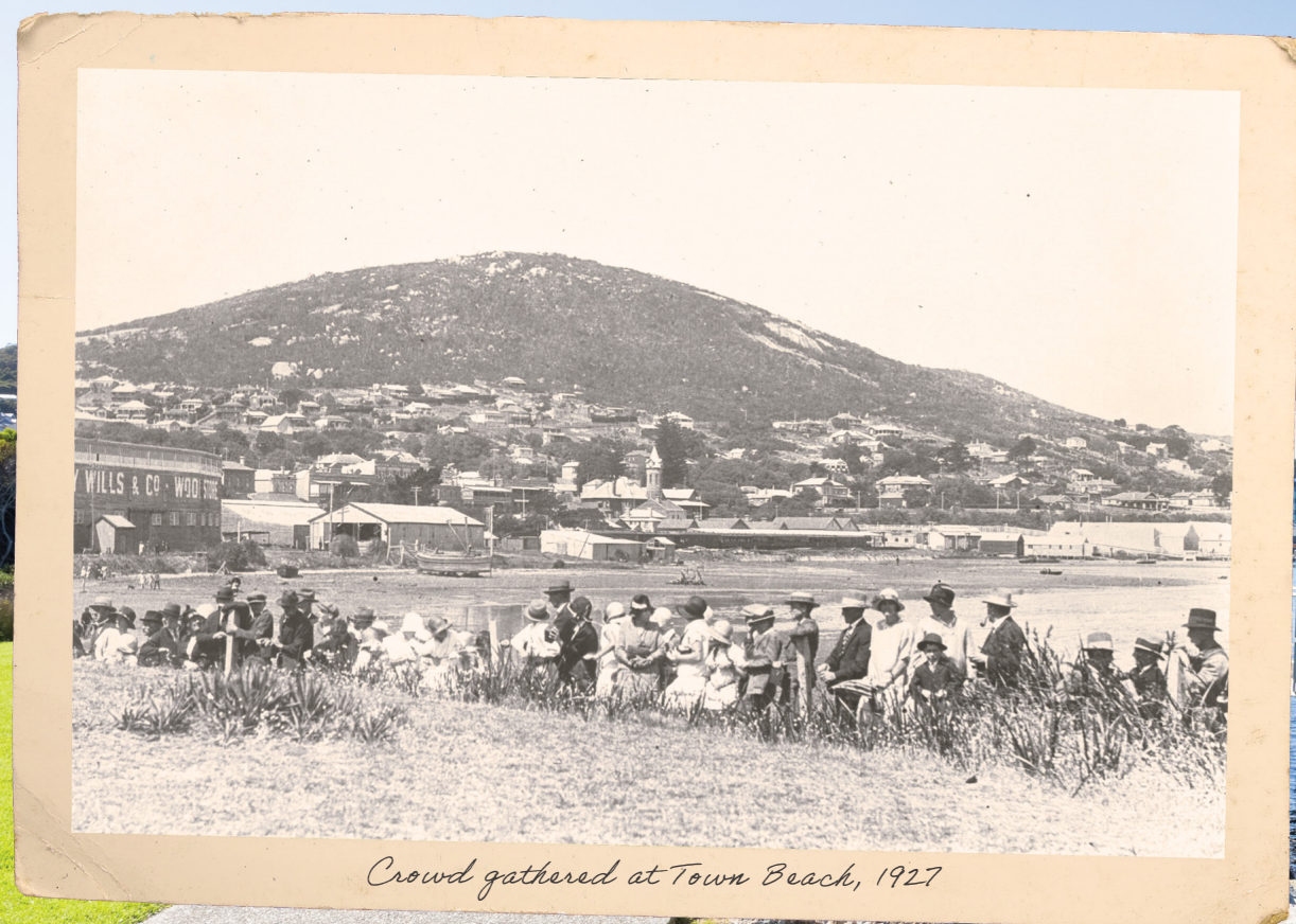
Crowd gathered at Town Beach, 1927

A crowd gathered at Town Beach on January 21, 1927, for a Centenary Day event at the Residency. Kalyanup / Residency Point – now the site of the Museum of the Great Southern – has long served as a gathering place for the community, and means home or camp place in the Menang Noongar language.