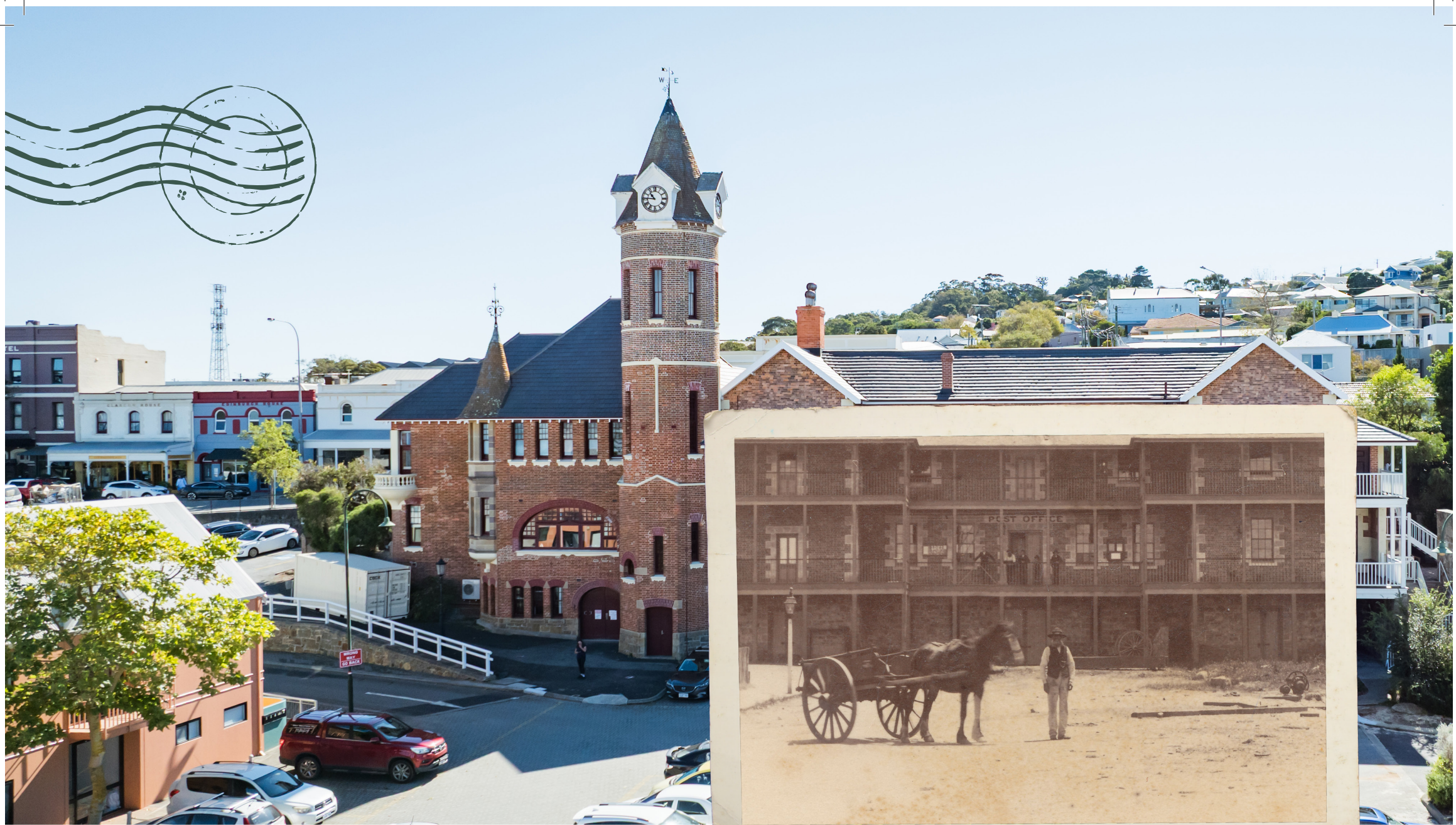
Rear of the Post Office, circa 1880

From 1867 to 1889, mail from the Albany Post Office to Perth was dispatched by coach, taking around three and a half days. From June 1889, a mail van with sorting facilities was added to the Great Southern Railway trains, reducing the delivery time to just 18 hours.