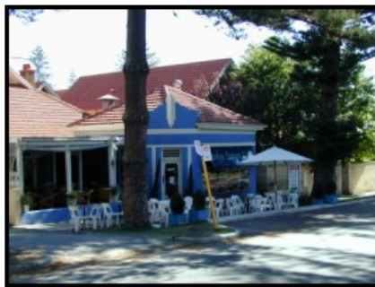
'Local Mixed Use Street'