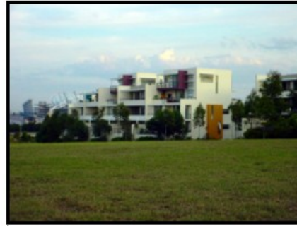
'Residential Edge to Park'