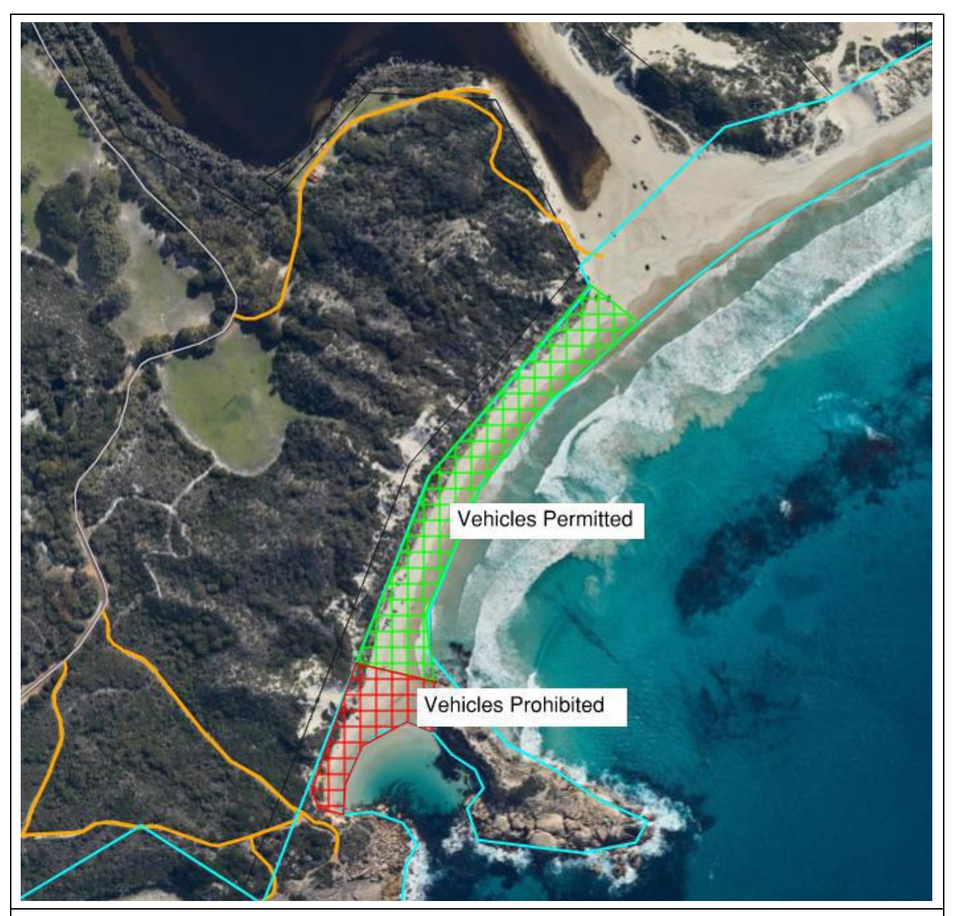
Nanarup Beach -