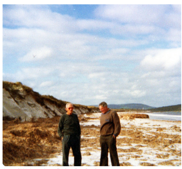
August 1984, Severe Storm Erosion, Emu Beach

Most people in Albany's community are familiar with the coastal erosion at Emu Point, which was exacerbated by a large storm event in 1984. At the time, the City of Albany and other partners did the best they could with limited information and other resources. Now, the City wants to respond to future potential hazards in a well thought out way and in a way that the community supports and can afford. A CHRMAP is a useful tool which can provide options over a long time frame.