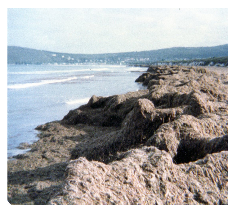
1984 Severe Storm, Emu Beach

Adaptation pathways are designed to include trigger points. These will trigger a management action to implement the identified adaptation option. For example, a storm event may trigger the managed retreat of an asset.