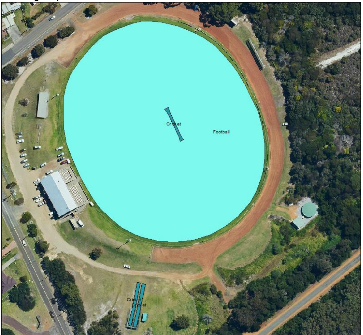
Page 9 of 69