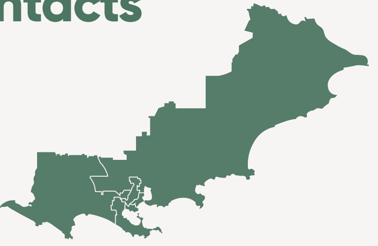
The City is divided into six wards, each represented by two Councillors. The wards are Breaksea, Frederickstown, Kalgan, Vancouver, West and Yakamia.

A Chief Executive Officer leads the administrative functions of the City, implementing policy directions and decisions set by the Council. Council meetings are currently held on the fourth Tuesday of each month at 6pm in the Council Chamber on North Road.